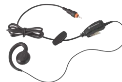
Earpiece with inline PTT button

This revolutionary, clean design provides rapid charging of your Motorola CLP. A Multi-unit charger allows you to conveniently charge up to six Motorola CLPs simultaneously. The charger is designed with a back pocket to store your earpiece while the unit is charging, and can be mounted on the wall if space is at a premium.