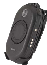
Swivel Belt Holster